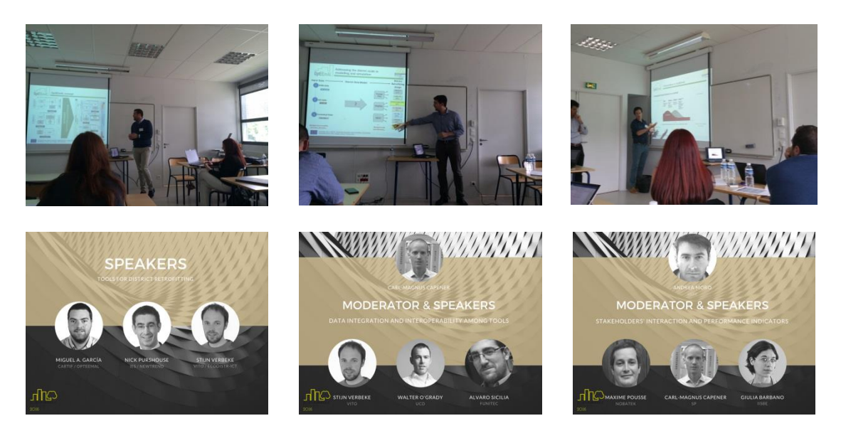
Figure 3: Pictures from the OptEEmAL, NEWTREND and ECODISTR-ICT joint workshop under the SP16

OptEEmAL has worked towards implementing a collaboration strategy which included these projects, as well as others as ECODISTR-ICT. Under this framework, a common workshop on District Renewal titled "Innovative tools and systems for increased participation in district retrofitting & renovation" was organised within the framework of the Sustainable Places 2016 event celebrated in Anglet (France) in June 2016. In this workshop several partners from the projects OptEEmAL, NEWTREND and ECODISTR-ICT discussed on the generated progresses as well as the problems they had faced.