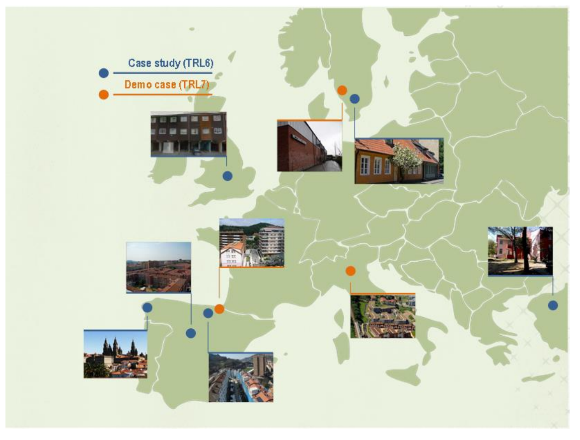
Figure 2: Pre-selected case studies within OptEEmAL